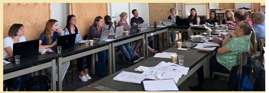
Exten(DT)<sup>2</sup> team members in Ghent, Belgium

The third face-to-face project meeting was held in Ghent between 27 and 29 September 2023. Team members from Sweden, Greece, the UK, Belgium, Norway and Ireland reflected on the pilot year of the project and discussed strategies to cope with emerging challenges that they may face while implementing design thinking (DT) projects in the second year of the project. They also discussed the extended versions of project technologies including MaIT2, SorBET, ChoiCo, nQuire for students, which have been modified following teacher and student feedback.